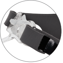
Adjustable forehead rest for comfort and stability