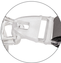
Quick-release clip eliminates the need to refit after removal